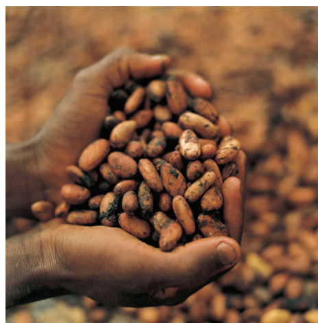
Cocoa beans.

The issues and impacts described above generate significant risks for the manufacturers of chocolate products, as well as for investors in those companies.