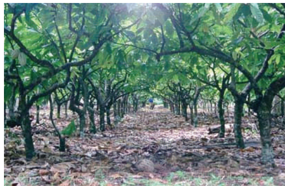
Cocoa plantation.

Three of the most important multi-stakeholder initiatives in the cocoa supply chain are the World Cocoa Foundation (WCF), the International Cocoa Initiative (ICI) and the Roundtable for a Sustainable Cocoa Economy (RSCE).